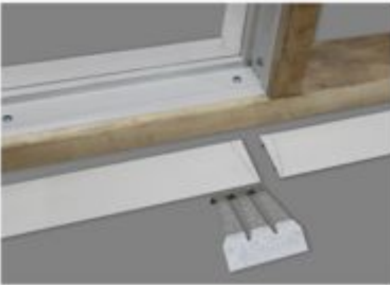
90° Corner and marked pieces