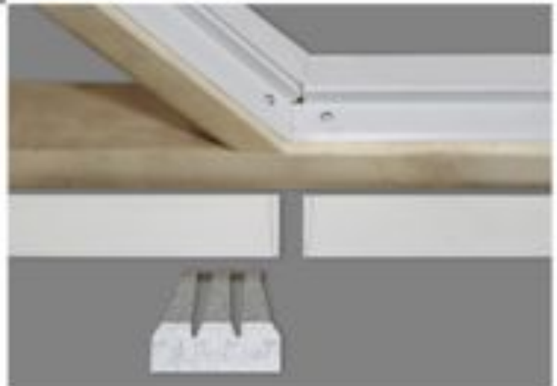
45° Corner and marked pieces