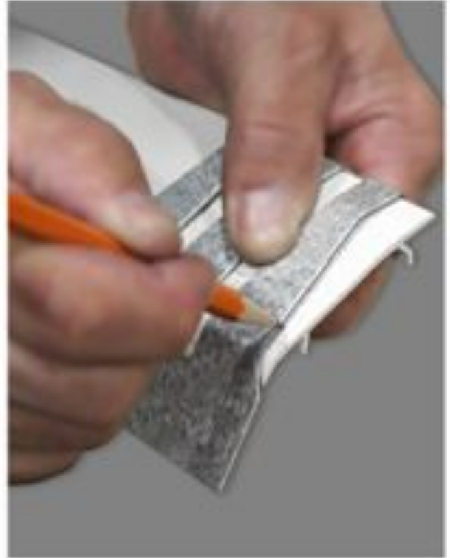
Mark for cut off